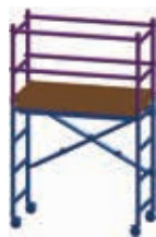
CONFIGURATION 1B PLATFORM HEIGHT 1.5m Base Pack + Guard Rail Pack