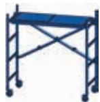
CONFIGURATION 1A PLATFORM HEIGHT 1.5m Base Pack

Colours indicate packs required to complete configuration