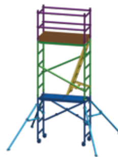
CONFIGURATION 3 PLATFORM HEIGHT 3.4m Base Pack + Extension Pack + Guard Rail Pack + Ladder + Toe Boards + Outrigger Pack