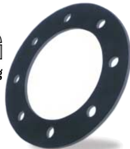
Colour - Black

Your home and hosed with Brierley Hose and Handling