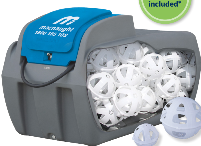
*Baffles included on MDT1000L and MDT1200L models only