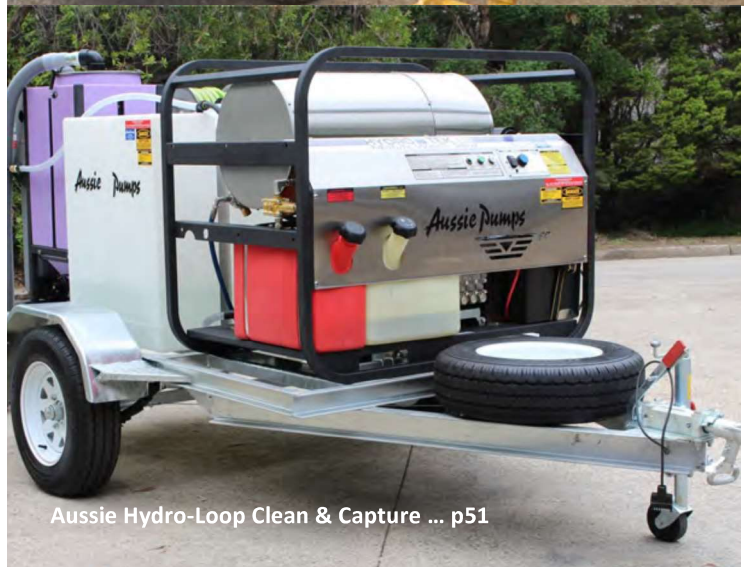
Aussie Hydro-Loop Clean & Capture ... p51