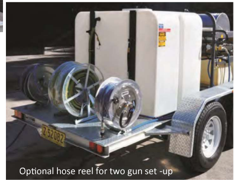
Optional hose reel for two gun set -up