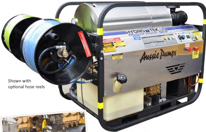
Shown with optional hose reels