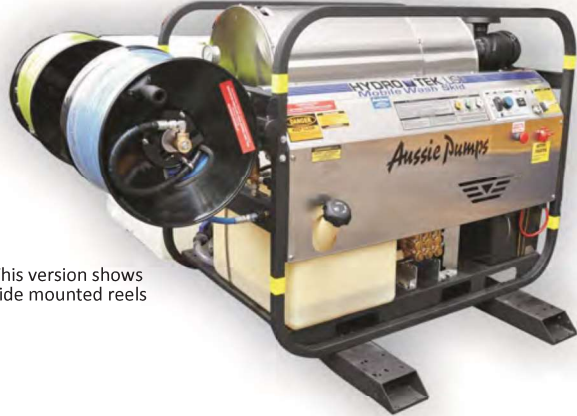
This version shows side mounted reels