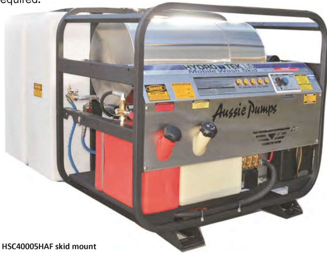
HSC40005HAF skid mount

The Hydrotek series are high pressure, mobile steam cleaners with serious cleaning power. They are self contained so no external power or water source is required.