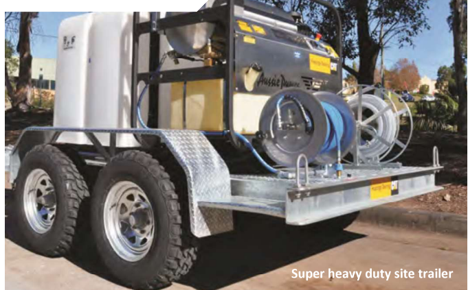
Super heavy duty site trailer

A skid or trailer mounted Mine Spec series mobile steam cleaner with it's own water supply. Ideal for on site cleaning!