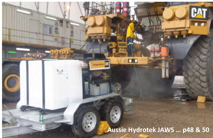
Aussie Hydrotek JAWS ... p48 & 50