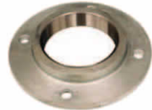
Forged Steel Plate Flange BS 10 (Table E - Screwed Gal)