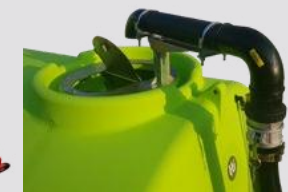
Hydrant Fill Lid

18m x 25mm Hose and Adjustable F/F Nozzle