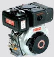
Yanmar Diesel Engine 4.8hp