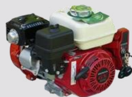
Honda Elec Start Engine

Honda Electric Start Engine with Battery Pack