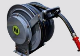
Spring Rewind Reel

1.5" Deflectors, Single actuator Valve with Remote Control & Pipework