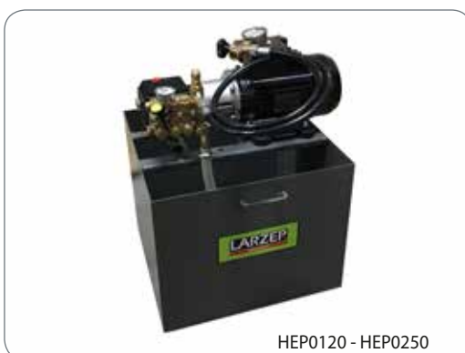
HEP0120 - HEP0250