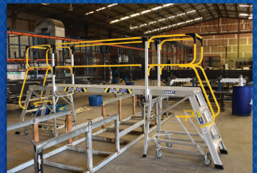
Manufacturing and Processing