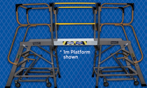
* 1m Platform shown