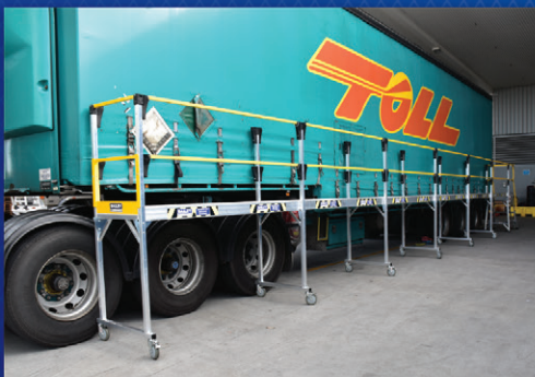
Transportation and Logistics

Specifically designed for adaptation to Transportation Industries, Aviation /Aircraft Maintenance, Manufacturing / Process Industries, Heavy Equipment Maintenance, Material Handling / Stock Picking, Warehousing and Mining Services Industries.