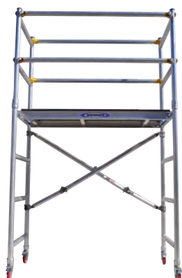
Model CARG-60AZ Erected

Compact design for easy mobility and storage